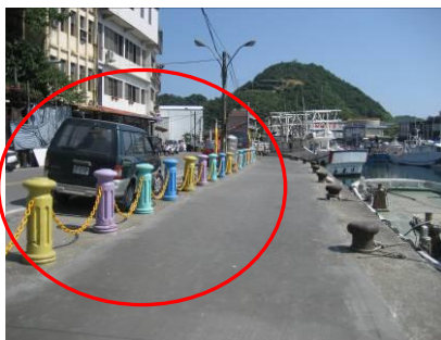
Safety promotion project along the harbor and coastline