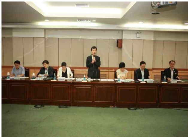
Gangbuk-gu Safe Community Committee